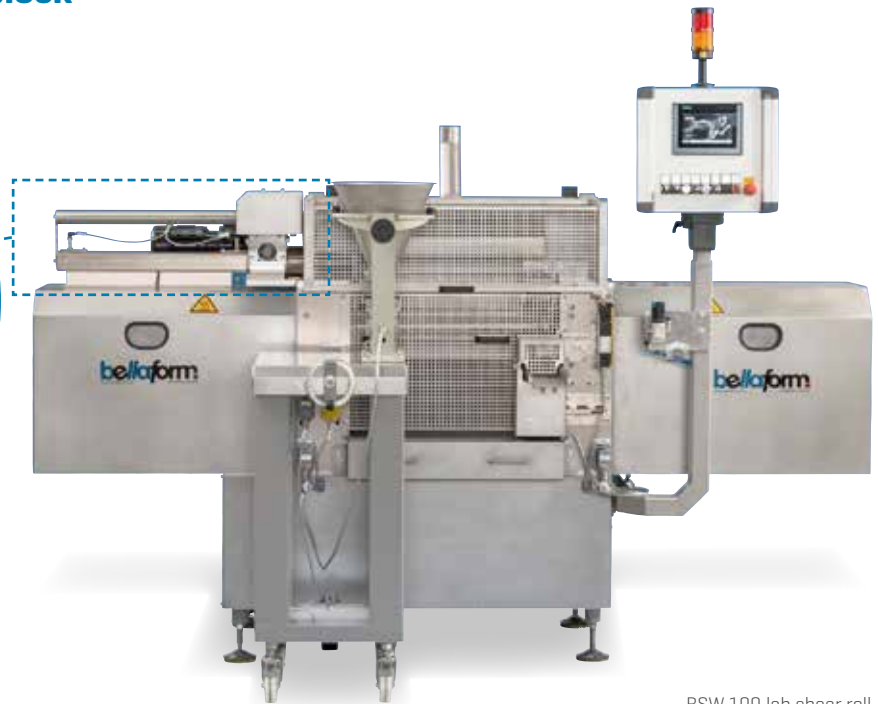
BSW 100 lab shear roll