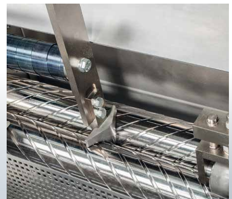
Electrically movable material block