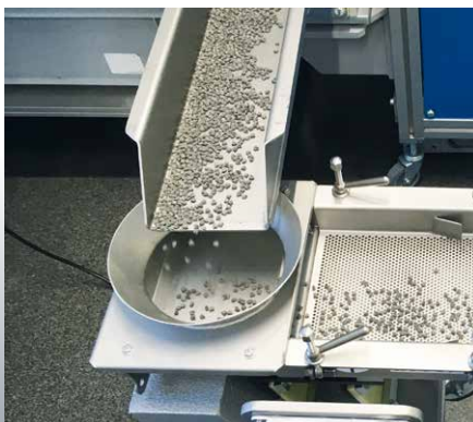
Vibrating screen for the screening of granulates

Our innovative modular extensions guarantee maximum efficiency in the processing of your solid mixtures.